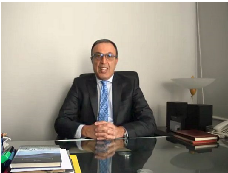
Petar Stoyanov congratulating winners of Bulgarian History Competition in a video message

Traditionally, the diplomas of the winners are awarded by former President Petar Stoyanov. However, this year the coronavirus reshaped many traditions and the former head of the state sent his congratulations to the participants virtually in a video message. The young people received their diplomas by mail, and their prize money was transferred into their bank accounts.